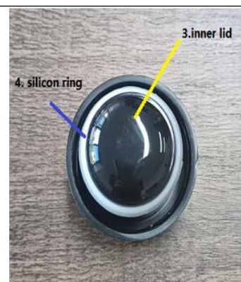
4. silicon ring