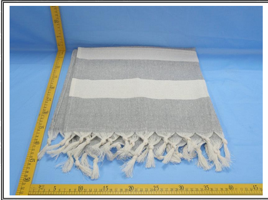
Photograph of parts tested: